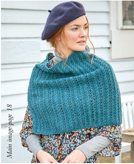
Main image page 18