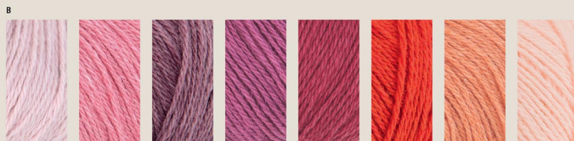
05 rosé 06 pink 20 beere 07 fuchsie 03 rot 26 paprika 08 orange 25 apricot