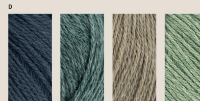
28 navy 23 tanne 24 oliv* 12 grün

* Nur solange Vorrat reicht · Only while stocks last