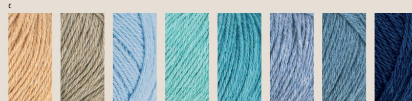
09 honig 11 muskat 27 hellblau 13 türkis 14 lagune 15 jeans 04 blau 22 indigo