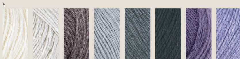
01 natur 10 sand 19 kakao 17 hellgrau 18 dunkelgrau 02 schwarz 21 aubergine* 16 lila